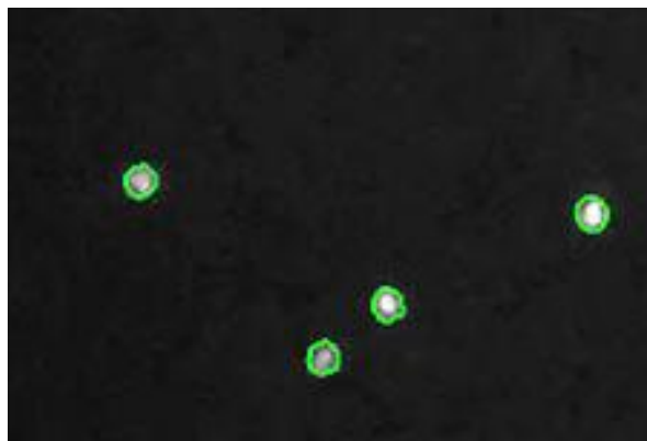
Figure 1. Fluorescent image showing counted AO stained WBC's. RBC's are not visible.

Cell and fluorescent size distribution histograms, scatter plots and data files can also be instantly generated. All experimental data can be instantly transferred to an Excel spreadsheet (Figure 2) or saved in a data table (Figure 3).