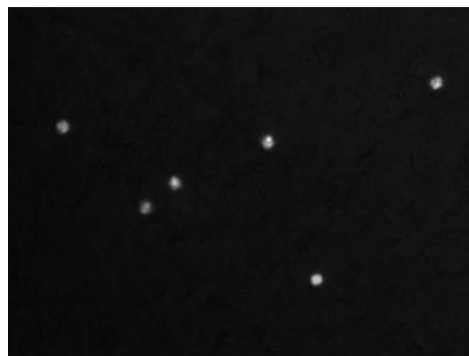
Fluorescent image showing AO stained WBC's. RBC's are not visible.